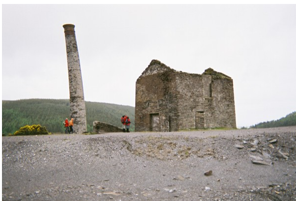
Beckwiths Mine (with curved chimney)

we looked at rocks of the Niarbyl Formation with ripple marks in the beds which indicated that they were formed by currents flowing from an area at present to the north or northwest of the quarry. Of mineralogical interest was a thin metabentonite bed formed by the metamorphism of volcanic clay.