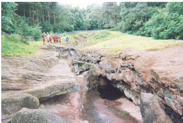
Engine vein at Alderley Edge

Edge. Roman mining activity is visible at surface and underground, and it now looks like copper mining started in the Neolithic Age. Other visits included a winch trip to Bage Mine, near Wirksworth, and deep wading in some of the long drainage adits of the area.