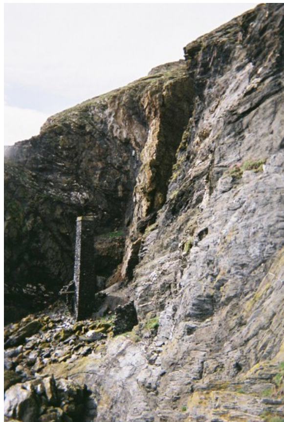
South Bradda Mine (on cliff)

After this crash-course in geology we headed to the south end of the island to view the spectacular remains of the South Bradda Copper Mine, which was worked intermittently from the Bronze Age to the 1850s.