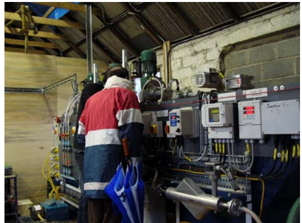
Pilot plant for treatment of Avoca acid mine drainage